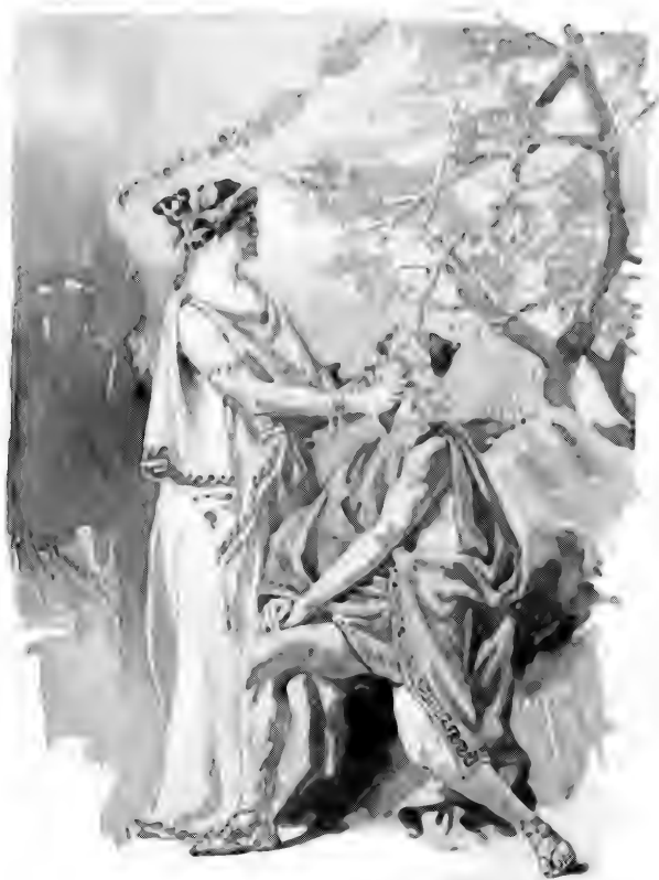
"CALYPSO, GLORIOUS GODDESS, SMILED, AND SMOOTHED HIS FOREHEAD WITH HER HAND."—Page 287.